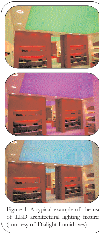
Figure 1: A typical example of the use of LED architectural lighting fixtures

However, increased competition amongst manufacturers, an ever increasing supply chain, improvements in material technologies and production yields will ensure price/performance ratios will be consistently achieved over the next few years. Japanese lighting leaders Toshiba Lighting predict that costs for LEDs could reduce to 1 Yen per Lumen by 2010 making costs comparable to those of halogen and fluorescents.